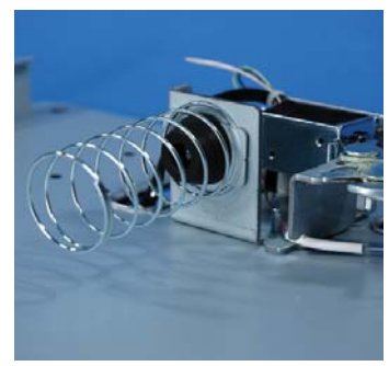
Heavy Duty 2-Stage Latch Mechanism