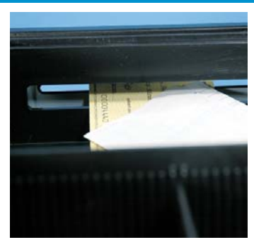
Large Storage Area Under the Coin Section