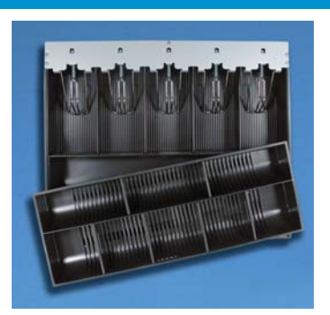
5 Bill / 9 Coin Insert Features Removable Coin Section with Adjustable Dividers