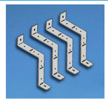
Easily Mounts Under the Counter with Optional Universal Brackets